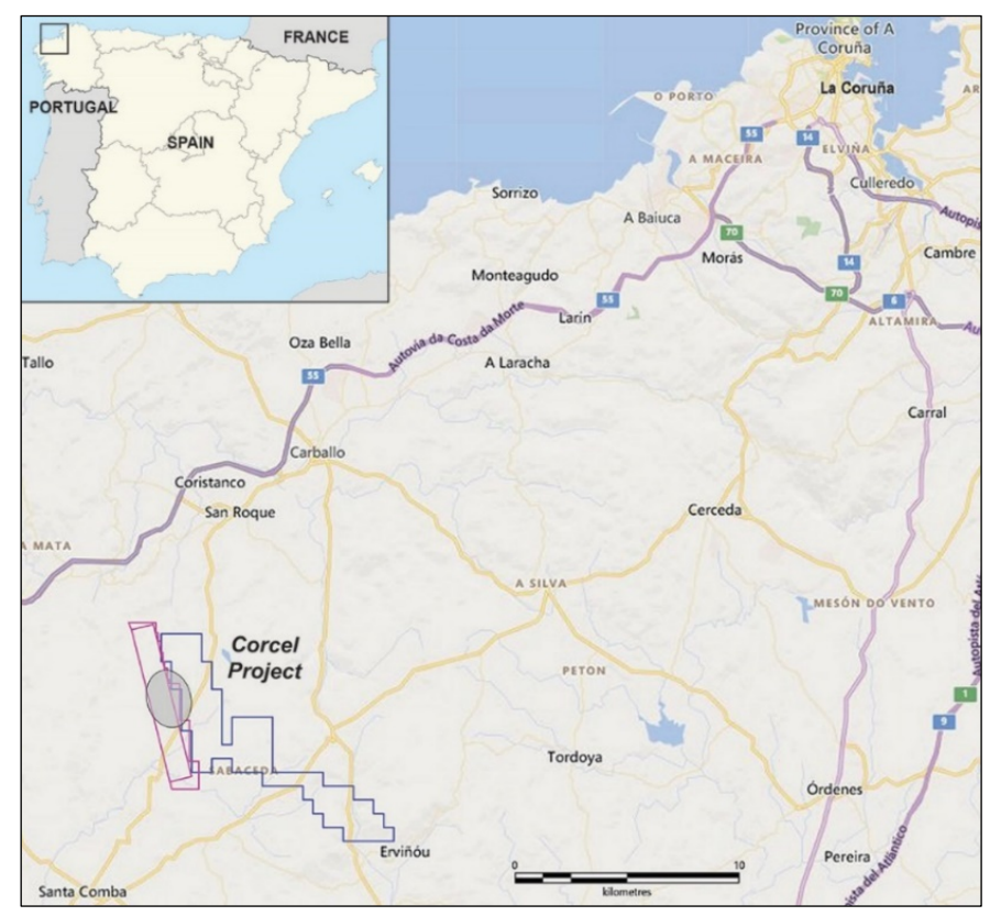
Figure 1. Location map of Corcel Project, Galicia, northwest Spain. Castriz prospect highlighted (grey ellipse).