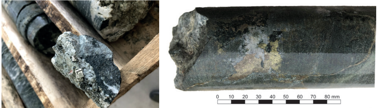
Figure 3. Photos of sulphides observed in the drilling at the Castriz prospect.